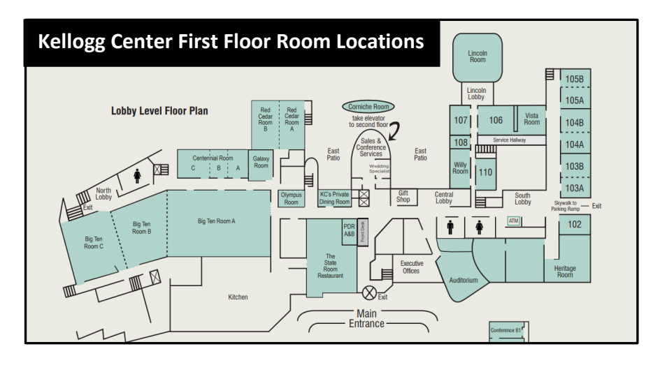
East Patio is down one floor via stairs or elevator